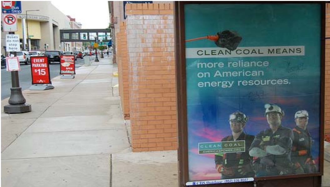
Clean Coal advertisement in St. Paul, Minnesota